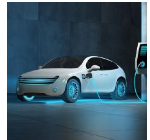
EV Charging Stations