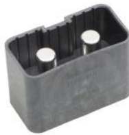
Blind-Mating Vertical Header