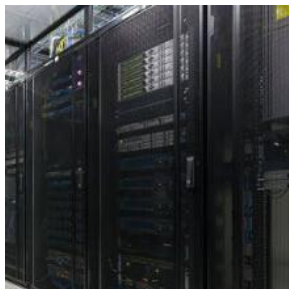
Uninterruptible Power Supply