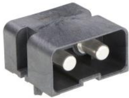
Blind-Mating Right-Angle Header

PowerWize BMI Connectors incorporate Molex's COEUR socket technology, transmitting high current-carrying capacity through right-angle and vertical headers. Available in three sizes—3.40mm (75.0A), 6.00mm (110.0A) and 8.00mm (185.0A)—the blind-mating design helps ensure proper connections in hard-to-reach and visually obscured spaces.