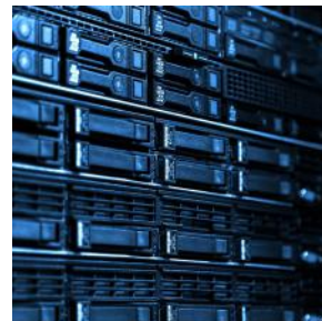
Data Center Servers