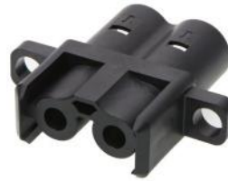
Blind-Mating Panel-Mount Receptacle Crimp