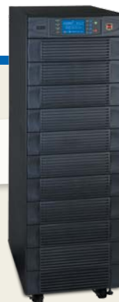
SmartOnline 3-Phase UPS Systems provide high-capacity centralized power.