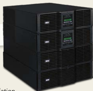
SmartPro® Line-Interactive UPS Systems provide automatic voltage regulation.

Protect valuable data from loss or corruption. Keep vital communications operational. Prevent downtime and lost productivity. Support continuous operation during generator startup.