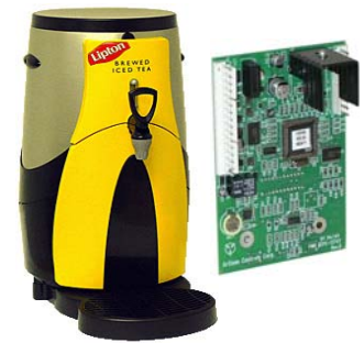
Beverage Dispensing Controller