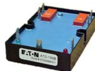
Transfer Switch Control