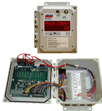
Trackside Lubrication Controller

Artisan has a long history of designing and manufacturing timers and controllers for the transportation, rail, and off road vehicle market. Some of our transportation customers include GE Locomotive, Wabtec, Bombardier, Alstom, Amtrak, John Deere, Hitachi, Mitsubishi-Caterpillar, Komatsu, BAE Systems, and BT Prime Mover. We make single and multi-function timers, sophisticated controls for lubrication and emergency lighting, all in custom and standard packages.