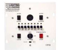
Programmable Light Lowering Controller