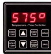
Rotisserie Cooking Controller