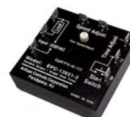
Time & Speed Motor Control