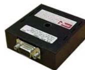
Aircraft Light Control

From the large to the small, Artisan has been filling the needs of the Original Equipment Manufacturer for decades. Some of our OEM customers include Eaton, Holophane, Wagner, Swagelock, Otis Elevator, Philips Medical, Carrier, and Motion Industries. Regardless of your industry, Artisan currently manufactures or can design a product which meets or exceeds the needs of your specific application.