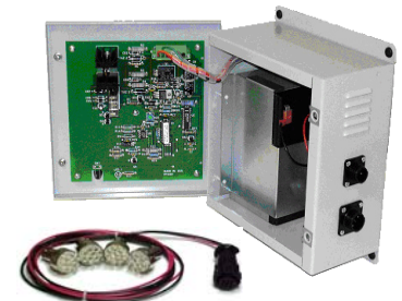
Emergency Lighting Controller