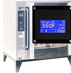
Cooking Controller w/ LCD Display

Artisan has developed numerous controllers for the food service and commercial cooking market. Our controllers incorporate the latest in monochrome and full color LCD displays, touchscreens to eliminate electro-mechanical buttons, multiple recipes with names instead of numbers, and have the ability to measure and control cooking temperature with RTD probes, thermocouples, and thermistors. Multiple relay and solid state outputs are a standard feature, along with multiple temperature probe inputs. Some of our customers include Pepsi/Lipton Partnership, IMI Cornelius, BKI, Blodgett, Nu-Vu, Hobart, KKO, Pitco-Frialator, Waring, Crescent Metal, and ITW.