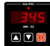
Customized Countdown Timer