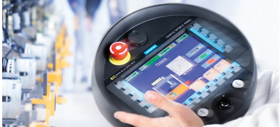
Wireless communications can deliver real-time data transmission, application mobility, and remote management capabilities.

Bluetooth is primarily a cable replacement for point-to-point connections, and is typically used more in consumer environments. Like WiFi, Bluetooth uses higher transmission power and requires higher battery power. Typically, batteries life can be measured in weeks. It is designed to connect short range, inexpensive devices and replace cable connection to computer peripherals like printers. Bluetooth is part of a group of technologies