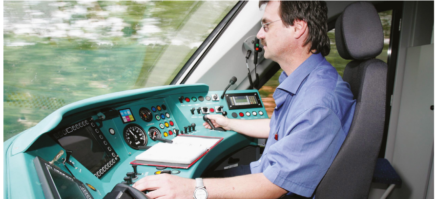
In the rolling stock rail transportation industry, many HMI Systems prefer direct hard-wired connectivity or use an intermediate connection to promote modularity.

Bus systems provide a wide range of advantages over hard wired connections, including easy addition of new functionality — typically through software — without adding or replacing hardware. Wiring is much simpler and more flexible with smaller cables and connectors allowing for more compact design, and easier hardware updating and relocation. Buses reduce subsystem installation time and simplify fault identification with on-board diagnostic features. Bus systems also allow for any combination of information