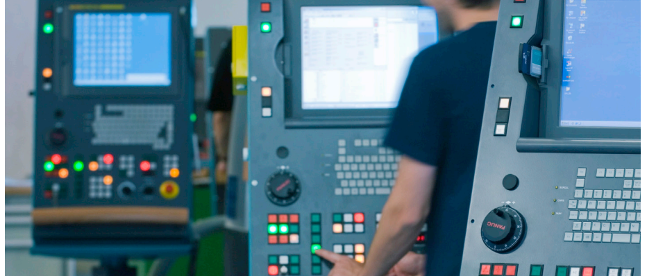
PROFIBUS is popular in manufacturing, process automation, and building automation.

In addition to the above-mentioned technologies, there are also connections between industrial networks and USB connections. USB hubs and ports can connect industrial wired and wireless system to this PC-based communication system. For hot swap of devices, and plug-and-play among PCs and a variety of peripherals. Using USB 2.0 hubs, typically housed in rugged enclosures, industrial USB communications support noise reduction for harsh environments, low power requirements, and good data speed at 480 Mbits/second. However, USB was not really designed for industrial use — any single bus segment can't exceed 5 m, and there's no provision for signal isolation. USB 2.0 finds its most common use in converters for serial-to-USB or Ethernet-to-USB.