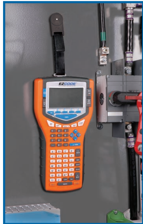
When you're working in tight spaces, the handy magnet strap lets you to stick the EZL500 printer to a vertical metallic surface to free your hands until you need to use it again.

In short, the EZL500 printer is ready to work on the lengthy jobs you have now and the ones you'll be doing years down the road.